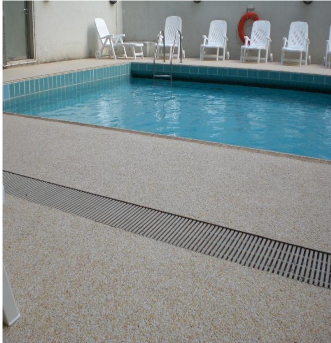
Standard Colour Chart